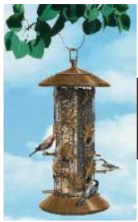
Squirrel Be Gone III Perky Pet #PP337