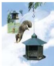
Squirrel Baffle Perky Pet #061161