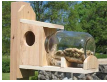
Squirrel Under Glass Feeder Nature's Select, #NSBBW8