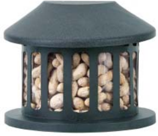
Squirrel Diner Heritage Farms, #053262