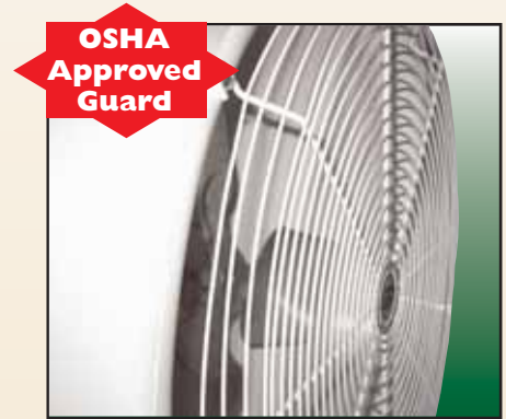
OSHA approved guard for installations above and below 7'