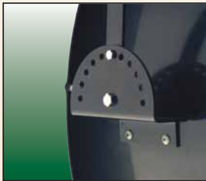
Multi-position side mount