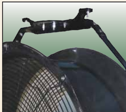
Multi-position top bracket