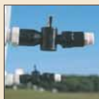
Independent Shut off nozzles