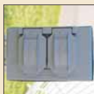
Independent Fan and Mist Switches