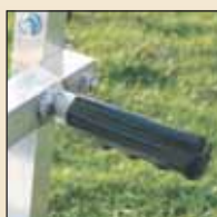
Comfort Grip Handles