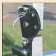
Lock Pins for fold-down option