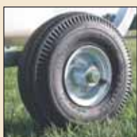
Rugged 8" tires