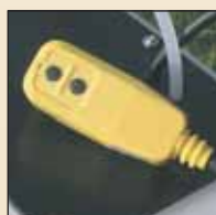
GFCI Plug-in attached