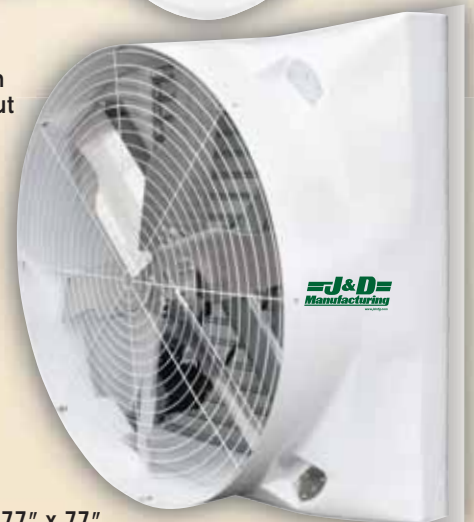
Shown without cone