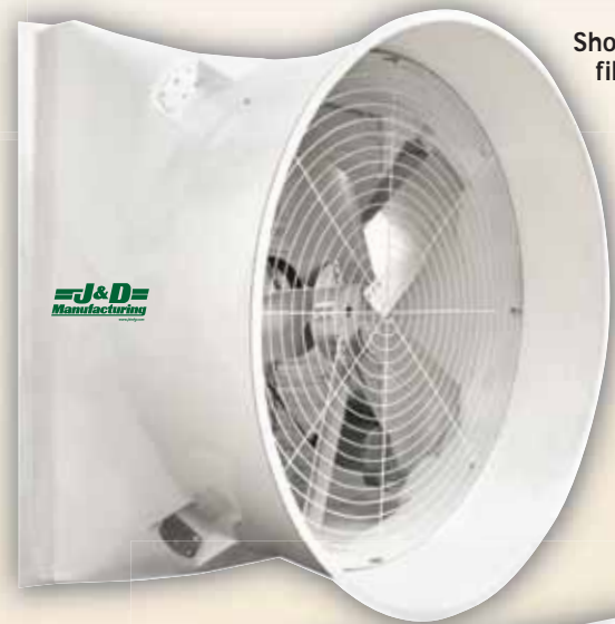
Shown with fiberglass cone