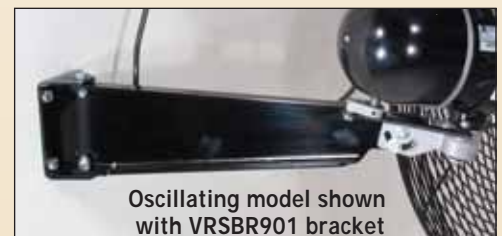
Oscillating model shown with VRSBR901 bracket