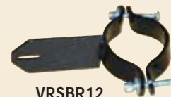
VRSBR12 and VRSBR13