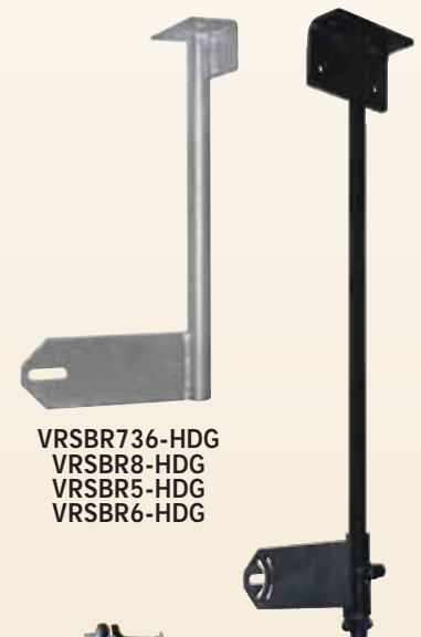
VRSBR736-HDG VRSBR8-HDG VRSBR5-HDG VRSBR6-HDG