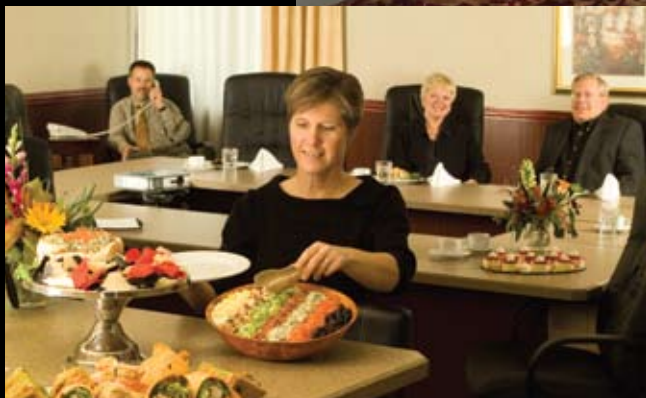
Executive board room