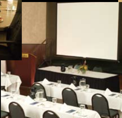
Large meeting facilities