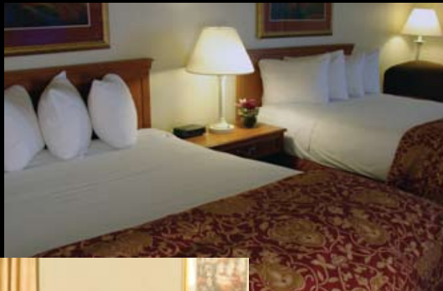
Deluxe guest rooms