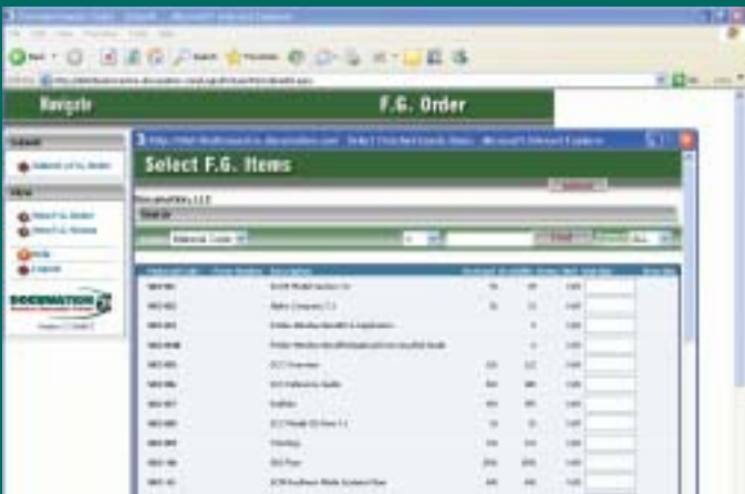
Choose from F.G. items and quantities that are to be included for this order.