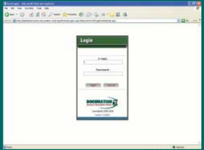
Distribution Centre login. Contact your Account Representative to set up your account.

and generate reports; all right now from your own office. Just click on the new Distribution Centre link at www.documation.com .