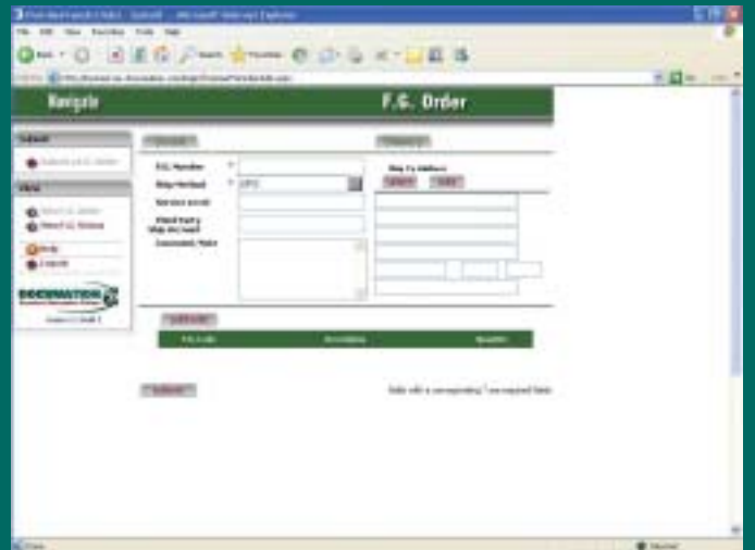
Place your finished goods order and communicate important shipping instructions to Documation.