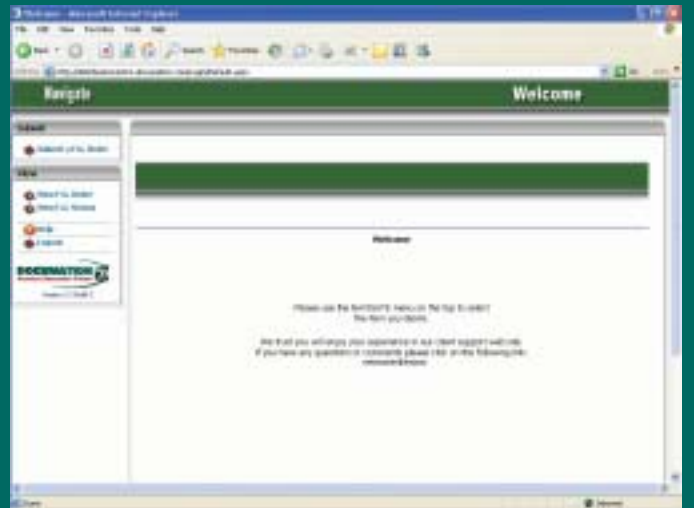
Once logged in, the Navigate Tool allows you to submit orders, review existing orders and review inventory levels.